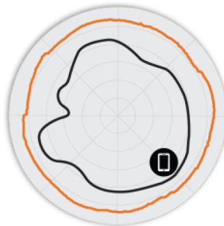
Figure 3. T750 5GHz Azimuth Antenna Patterns