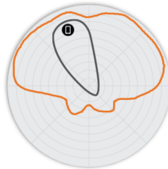
Figure 4. T750 2.4GHz Elevation Antenna Patterns