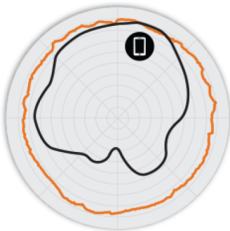
Figure 2. T750 2.4GHz Azimuth Antenna Patterns