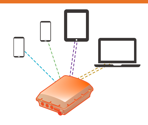
Blinding fast Wave 2 4x4:4 802.11ac with MU-MIMO