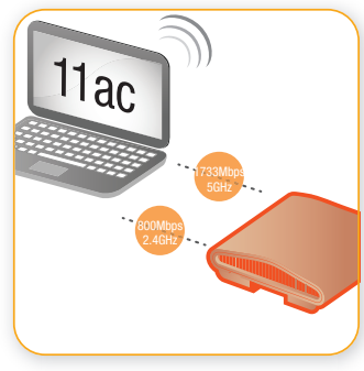
Blinding Fast 4-Stream 802.11ac