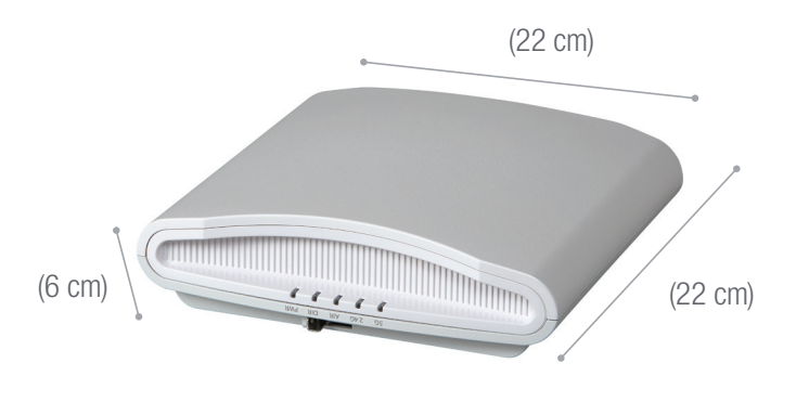
weight is 1.1 kg. (2.3 lbs.)