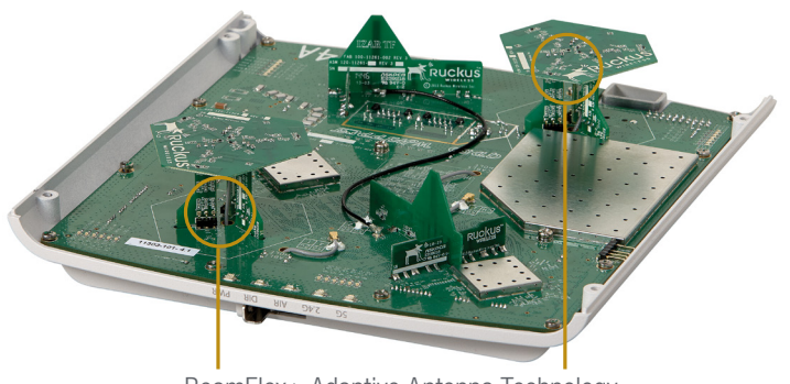
BeamFlex+ Adaptive Antenna Technology

Two 10/100/1000 Ethernet ports with 802.3af/at PoE